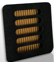
The superb Folded Motion tweeter.